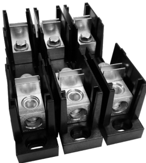
MSP - New